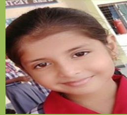
MAIRA 1 ST B STD