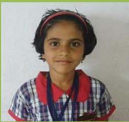
SHRAVAYA 2 ND A STD