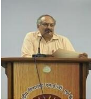
I/C DEPUTY COMMISSIONER BENGALURU REGION