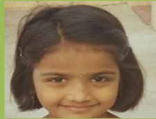
AMULYA 1 ST A STD